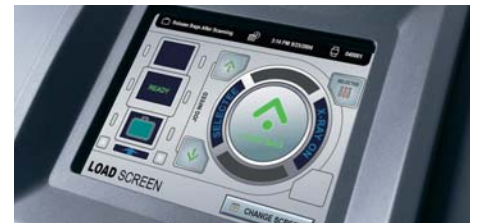
LCD touch screen Machine Control Interface (MCI)

To see how these solutions can benefit your airport and screening process, please contact us.